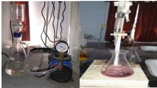
Fig. 2: Photos of a few laboratory tests.