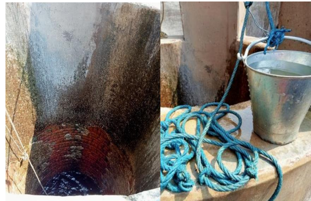
FIG 3: PICTURES OF THE SOURCES OF COLLECTED WATER

The correlation coefficients are represented in Table 5. It represents 49 correlation coefficients. From Table 5 it is observed that turbidity with other parameters (like TDS, DO, Alkalinity, Hardness, and Iron) are positive correlation that means these parameters increase then turbidity also increases. The correlation coefficient among TDS and alkalinity is the maximum negative value. TDS and alkalinity have a strong negative correlation.